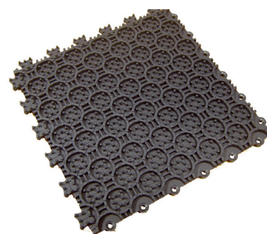
11mm Prior Closed Format

Tile Material: UV Resistant PVC Tile Construction: Closed Total thickness: 11mm Tile Size: Nominal 200 x200mm, usable 195 xs195mm when installed Tile Colour: Graphite