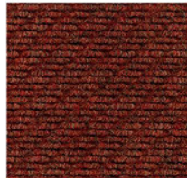
Castle 9 options Tile only