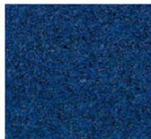
Fresca 10 options Sheet & Tile