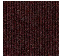
Freeway 27 options Sheet & Tile