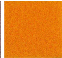
Primary Colours 5 options Sheet & Tile