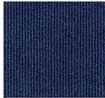
Eurocord 27 options Sheet & Tile