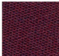
Champion 12 options Sheet & Tile