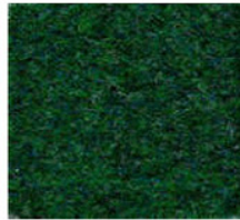
Felkirk 25 options Sheet & Tile