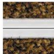
5716 | masala brown

Ultragrip rubber: Offers improved underfoot comfort and moisture removal.