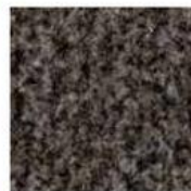
5714 | shark grey