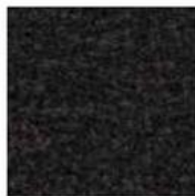
4750 | warm black