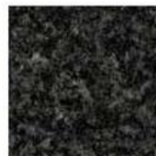
5721 | hurricane grey