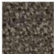
4764 | taupe