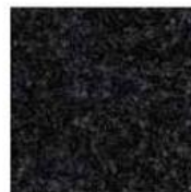
5730 | vulcan black