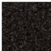
4730 | raven black