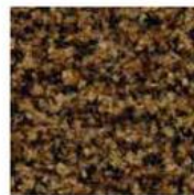
5716 | masala brown