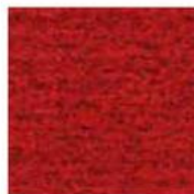
4753 | bright red