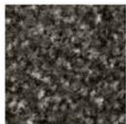
4701 | anthracite