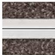
4764 | taupe